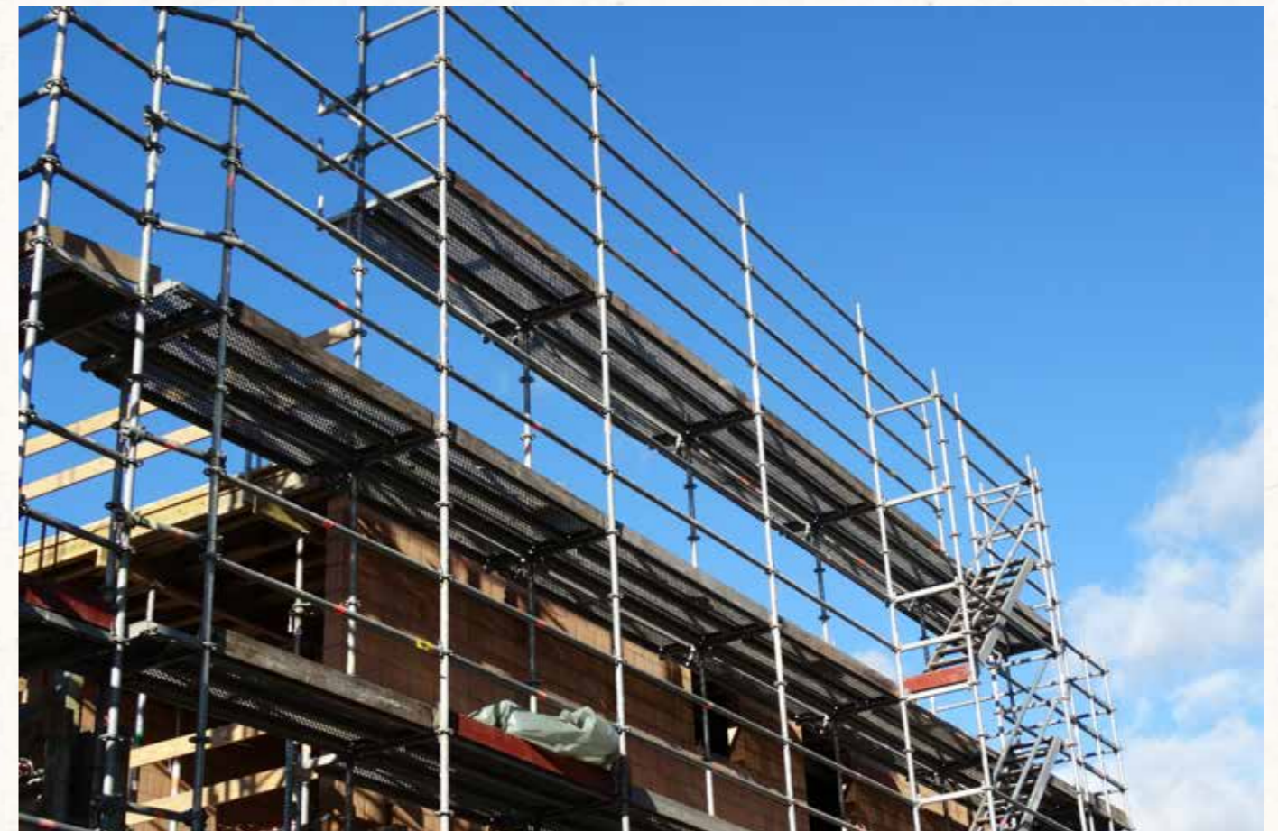
Scaffold steel planks and toeboards