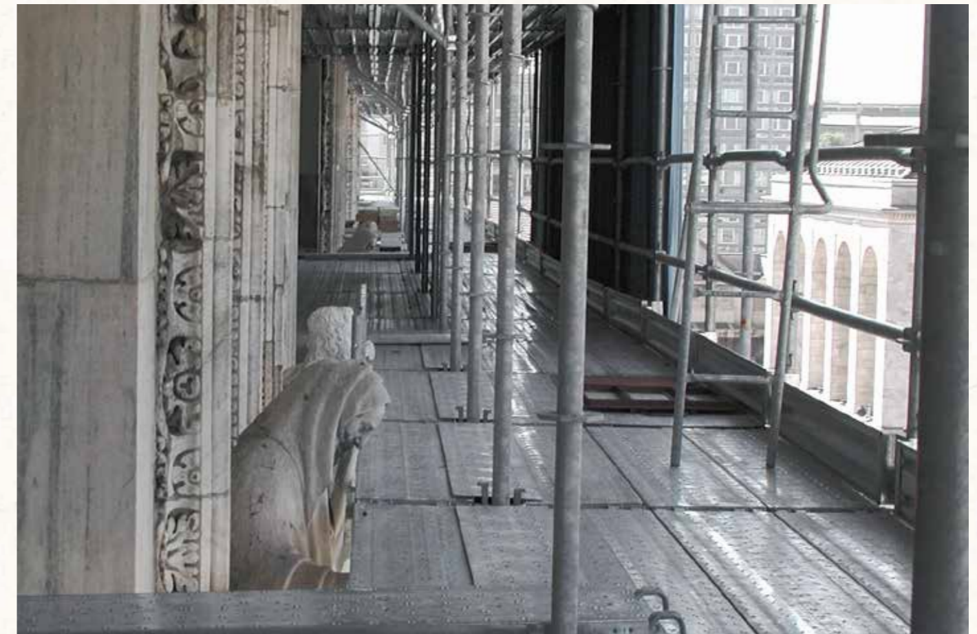
Scaffold steel planks and toeboards

This is the first publication of this EPD.